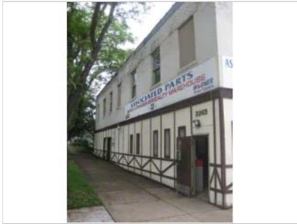
Associated Parts Store & Residential Apartments